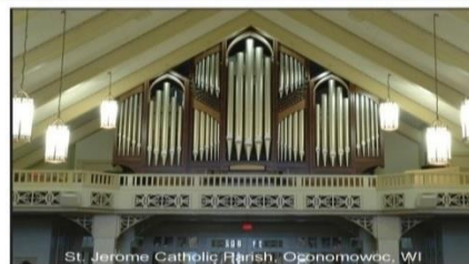
St. Jerome Catholic Parish, Oconomowoc, WI

708-544-4052 • info@berghausorgan.com • 2151 Madison St., Bellwood, IL 60104 • www.berghausorgan.com