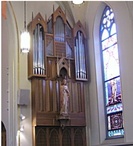
Nolte Organ - 2 manuals, 27 ranks, St. Joseph's R. C. Church, Waukesha